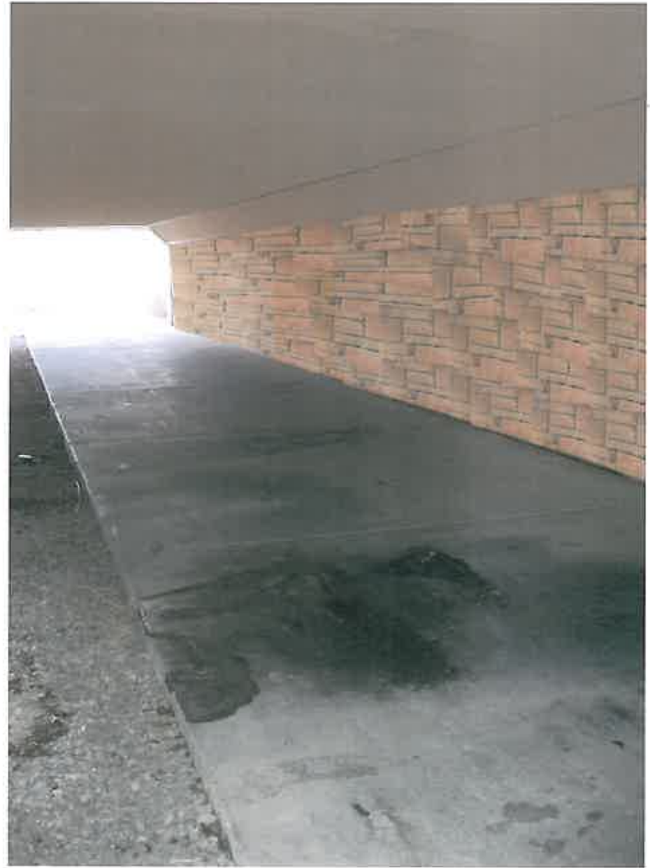
Stone Veneer ($85,000) Option