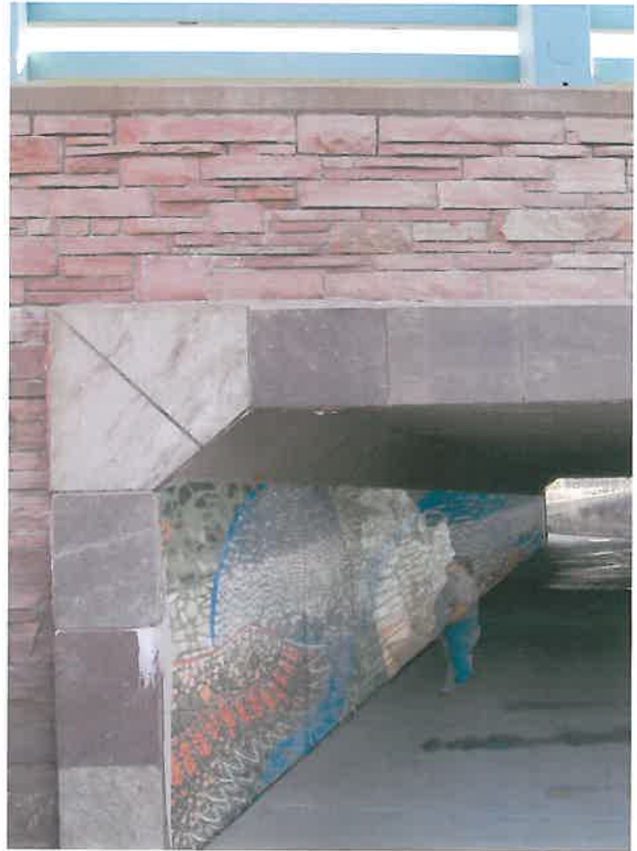
Public Art Option