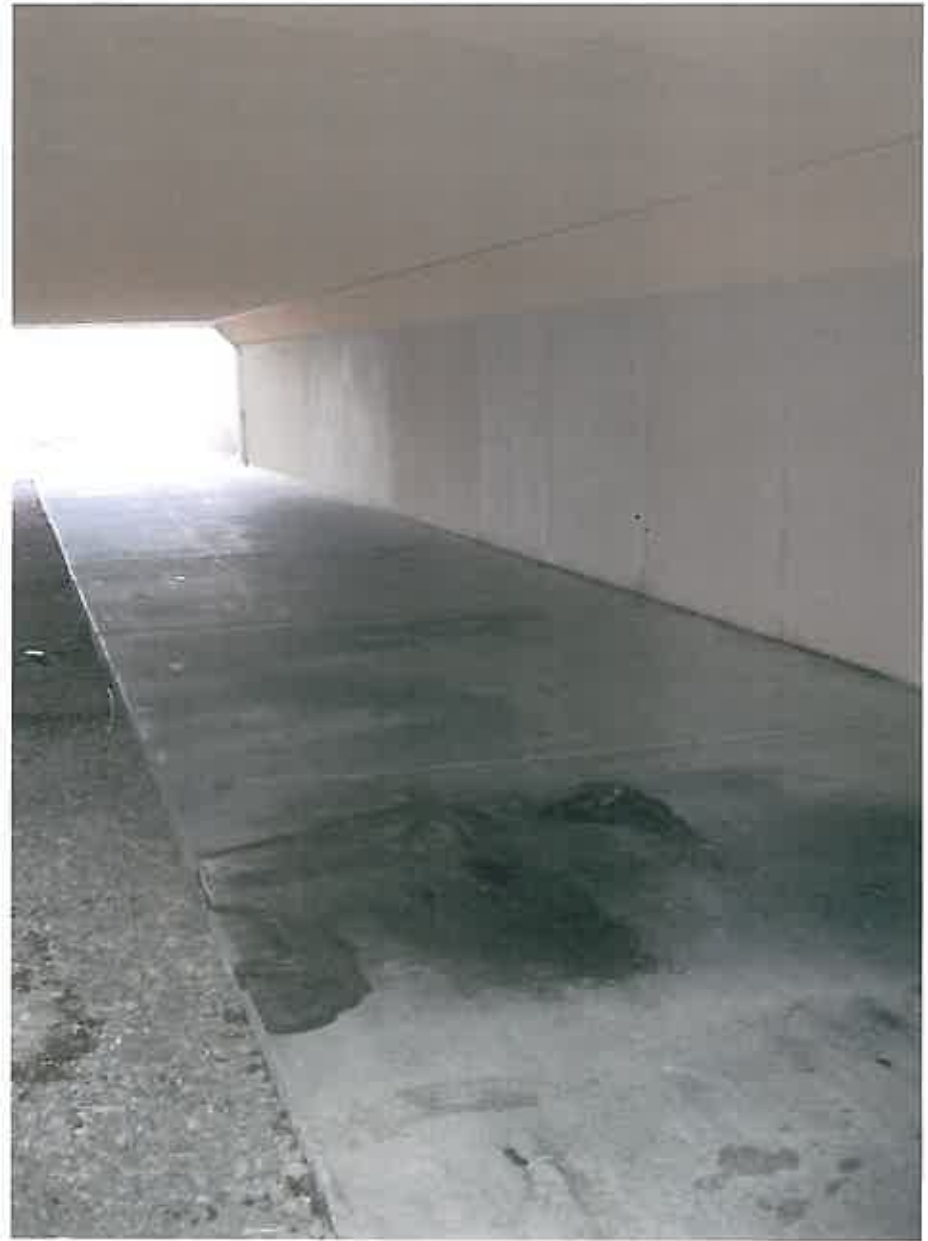
Paint ($63,000) or Epoxy Coating ($75,000) Option